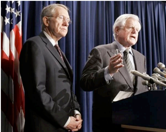
REID AND KENNEDY: PRO-HOMOSEXUAL, ANTI-CHRISTIAN?

If Conferees strip the good Brownback Amendment to the bad "Hate Crimes" Bill, not only will sexually deviant behaviors gain legal protection, this legislation also lays the legal foundation to investigate, prosecute and persecute pastors, youth pastors, Bible teachers, and anyone else whose speech and thought is based upon and reflects the truths found in the Bible. How will this legislation over-rule the First Amendment?