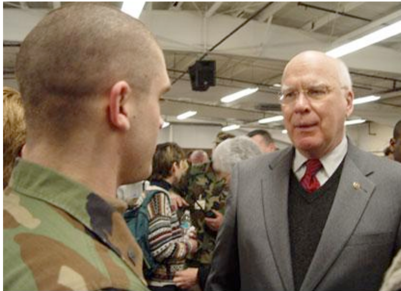
Leahy tells soldiers: "No funding unless you protect homosexuals"

By hiding the hate bill as an amendment to Pentagon spending, moderate Democrats (and all but two Republicans) are faced with a difficult choice: either pass the Pedophile Protection Act or STOP PAYING OUR TROOPS serving overseas . Faced with a "poison pill" many moderates may falsely claim they have no choice but to swallow.